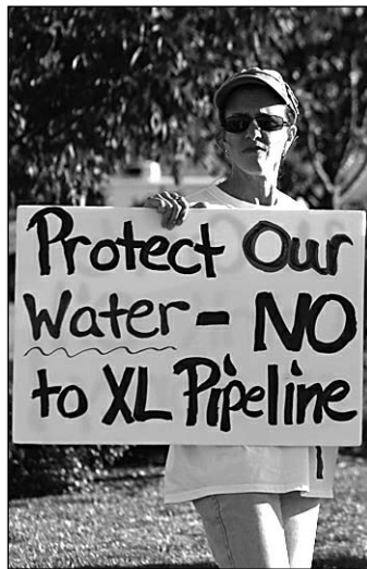
By Scott R Kemper

There are environmental concerns for every step of the project, starting with the clear cutting of Canadian forests and then strip mining the landscape. The refining process requires a great deal of energy and creates toxic by-products that are stored in huge tailings ponds. These tailings ponds